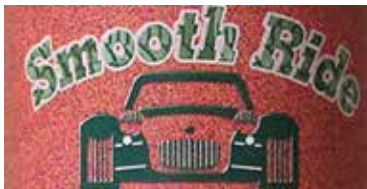
8170 SMOOTH RIDE RUBBERIZED UNDERCOATING

Seal out moisture and salt to prevent rust and corrosion without the mess or odor of asphalt-based products.