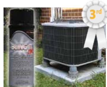
5710 BLING IT ZINC Shiny Galvanized Coating