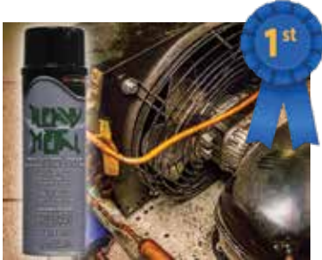
5010 HEAVY METAL Heavy Metal Degreaser

As 2024 comes to a close, we thought we would share which newly introduced products captured the enthusiasm of our customers this year. In order, the top six best-selling new products are: