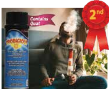
3040 PRODIGIOUS Total Release Malodor Neutralizer