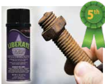
5612 LIBERATE PTFE & Moly Penetrant