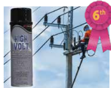
5015 HIGH VOLT High Voltage Cleaner/Degreaser