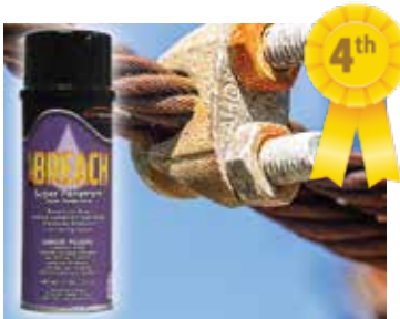
5451 BREACH Super Penetrant