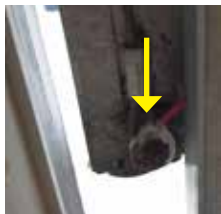
PULLEY CABLE BOTTOM