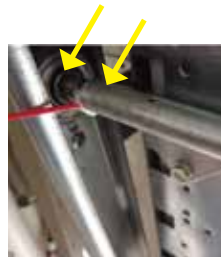
ROLLER PIN & BEARINGS