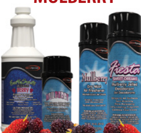
2850 EARTH SCENTS BERRY Enzyme Treatment 3140 MULBERRY Total Release

3140 MULBERRY Total Release Odor Eliminator (manual/fogger)