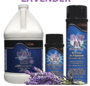
2580 SIMPLY LAVULOUS Lavender All-Purpose Cleaner

3690 LIV LAV LUV Total Release Odor Eliminator (manual/fogger)