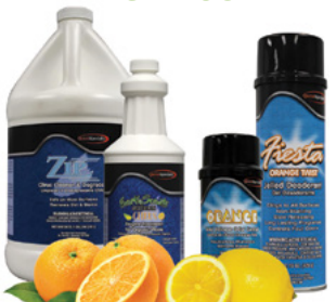
2840 EARTH SCENTS Citrus Enzyme Treatment 2640 ZIP Citrus Cleaner & Degreaser 3130 FIESTA ORANGE TWIST Jelled Deodorant 3280 ORANGE Total Release