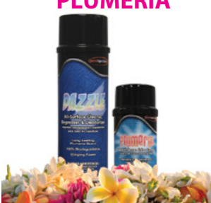
2100 DAZZLE All-Surface Cleaner & Degreaser 3820 PLUMERIA Total Release Odor Eliminator (manual /fogger)