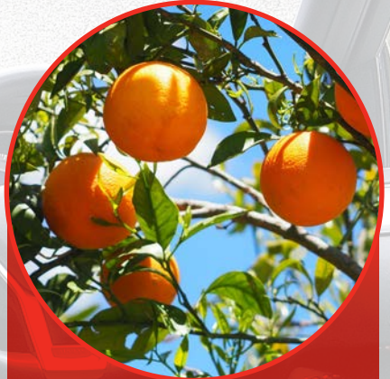
TOTAL RELEASE WATER-BASED AIR FRESHENERS