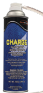
2050 CHARGE Condensate Drain Cleaner