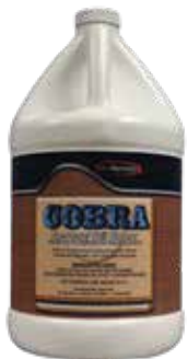
6601 COBRA Foaming Alkaline Condenser Coil Cleaner

Air Filters: When using any coil cleaner.