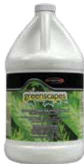
2720 GREENSCAPES Concentrated Neutral Cleaner (condenser & evaporator)