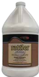
6606 RATTLER Evaporator Coil Cleaner